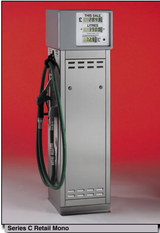
Series C Retail Mono

An affordable, financially sound solution to re-pumping when it pays to stand out from the crowd.