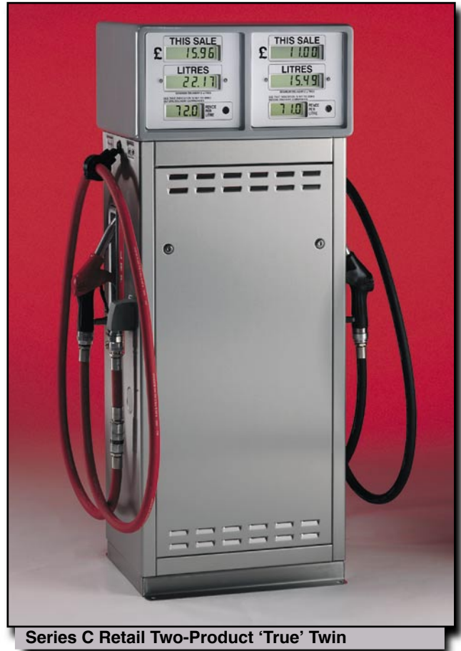
Series C Retail Two-Product 'True' Twin